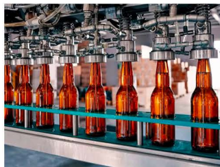
BREWERY / BOTTLING