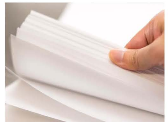
PRINT AND PAPER